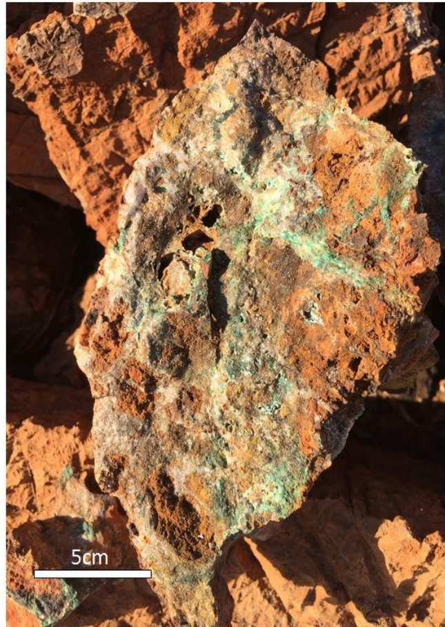
Figure 7: Hydrothermal Breccia with malachite and chalcocite mineralisation at Wyloo West Prospect